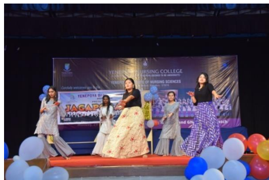
Fig: 4 Cultural events

The Freshers day for the 20 th Batch of B.Sc (N) and 18 th batch of General Nursing and Midwifery students of Yenepoya Nursing College was held on 28 th February 2022 at Yendurance Zone between 10:30am to 12.30am.