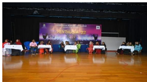
Fig: 5 Intercollegiate quiz

The Student Nurses' Association (SNA), Yenepoya Nursing College, Yenepoya (Deemed to be University) organised a Regional level Intercollegiate Quiz and cultural fest on the occasion of International Nurses' Day on May 1 th and 12 th , 2022, from 9-5pm in the Yendurance Zone of Yenepoya (Deemed to be University). The Paediatric PG Alumni Chapter hosted a Regional Intercollegiate Quiz Competition.