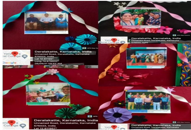
Fig: 1 Departmental notice board with teacher's day wishing

Students Nurses Association (SNA) Yenepoya Nursing College, Yenepoya (Deemed to be University) organized a Teachers day on 6/9/2021. SNA office-bearers prepared 15 minutes heartfelt teacher's day wishing video of the B.Sc [N], PB.B.Sc [N] and M.Sc [N]. Video releasing at 9am through online mode. The notice boards of the Community Health Nursing, Medical Surgical Nursing, Paediatric Nursing, Psychiatric Nursing and OBG departments were adorned by wishing invitation. SNA office bears distributed sweets to teachers and non-teaching staff.