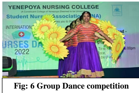
Fig: 6 Group Dance competition

The Student Nurses' Association (SNA), Yenepoya Nursing College, Yenepoya (Deemed to be University) organised a cultural events on the occasion of International Nurses day on May 1 th and 12 th , 2022, from 9-5pm in the Yendurence Zone. The cultural events were participated by B.Sc (N), GNM, PBB.Sc (N), Postgraduate, alumni, and staff.