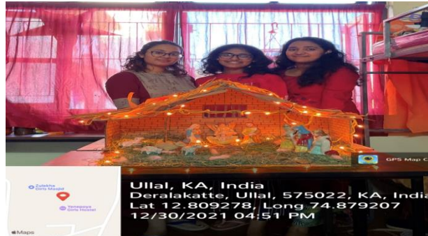
Fig: 3 Crib Making Competition

Students Nursing Association (SNA), Yenepoya Nursing College, Yenepoya (Deemed to be University) organized cultural events on the occasion of the Christmas festival on 18th of December 2021 at 9:30 am-4 pm. The program was inaugurated by cutting the cake. On this occasion, SNA units conducted carol singing, crib making, best Angel, best Santa clause and crib making competitions online platform mode.